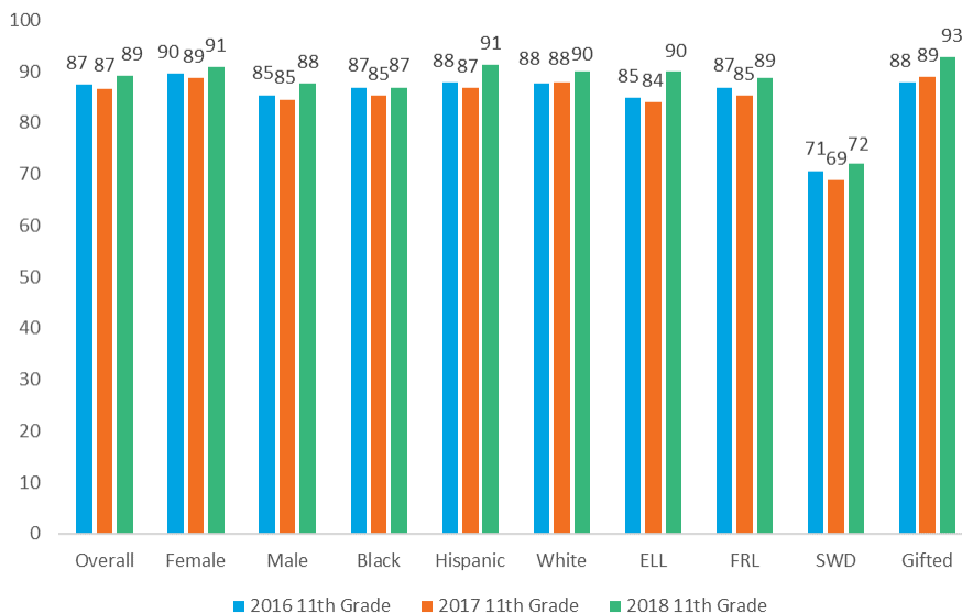
SAT Participation Among 11th Grade Students