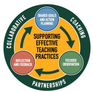
National Center on Quality Teaching and Learning, 2012

The Elementary Learning Department has a tradition of providing professional development to support teachers as they implement effective practices that lead to positive outcomes for children. Coaching is a strategy that aims to ensure quality teaching and learning practices are implemented with accuracy and result in positive outcomes for students. It supports the reflective process that professionals need to translate the theories and information learned through ongoing learning into best practices in the classroom setting as illustrated below.