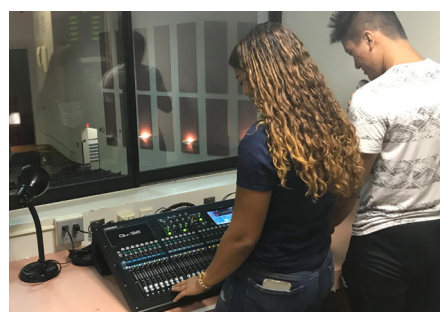
Sound System Upgrades