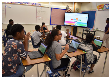
Televisions for Classrooms