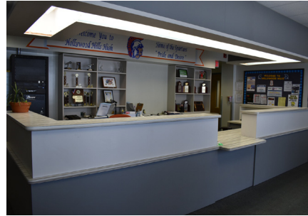
Welcome Center Renovation