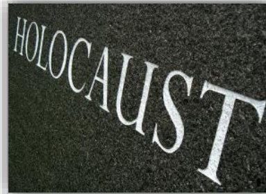
New England Holocaust Memorial, Boston