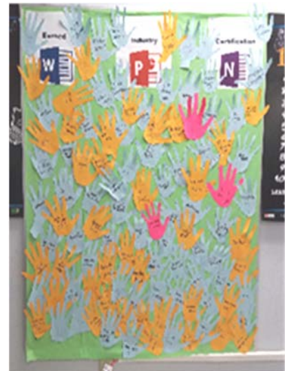
Emerging Tech's Certification Wall Expands!