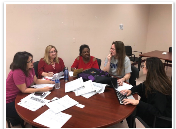
A recent grant writing workshop at Bright Horizon's ESE Center

Please contact GAGP if you would like to request a basic or advanced grant writing workshop for your school community.