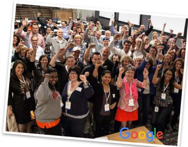
Google Computer Science Teachers