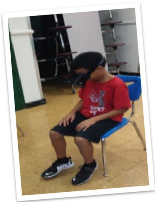
Crystal Lake Middle students utilized 3D goggles in order to experience and understand science standards.