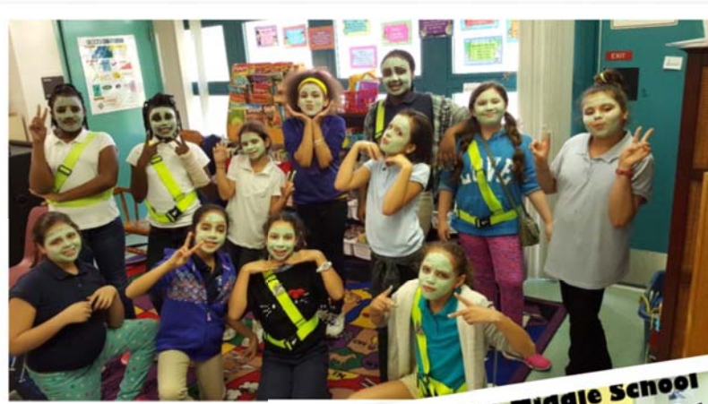
Pompano Beach Elementary students learning to be responsible leaders.