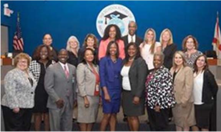
Pictured above: Recognition of the TIF grant award and TIF grant proposal development team by the Broward County School Board on October 18, 2016.

BCPS is honored to be the only school district in Florida – and the only large urban District in the nation – to receive a new Teacher Incentive Fund (TIF) grant from the U.S. Department of Education. The TIF grant funding supports the District’s use of performance-based compensation and other strategies to increase students’ access to effective educators in high-needs schools. BCPS has identified 32 schools to participate in the TIF program, based on having 50 percent or more of their student populations qualifying for free or reduced price lunches. The grant-identified priorities for the District’s TIF program include: Improved life outcomes for students; fostering a thriving learning communities of highly effective educators in high-need schools; and developing a fully-aligned and well-functioning Human Capital Management System.