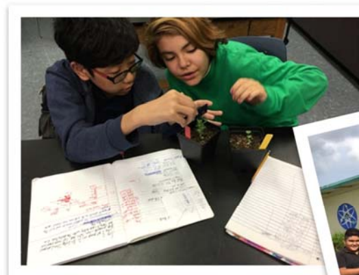
Parkway Middle School Horticulture Program