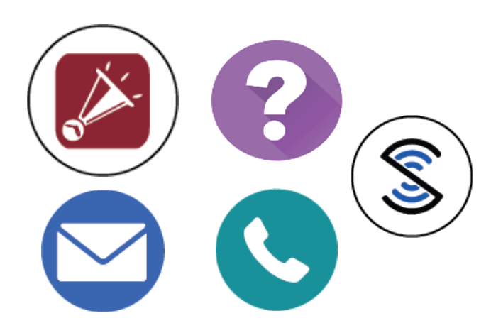
Report it using the tip reporting tools