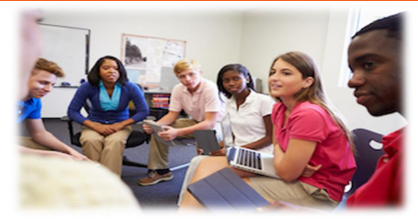
Encourage students to report a tip or tell someone