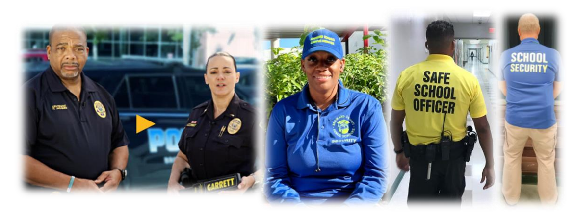
Tell a member of the Security Team