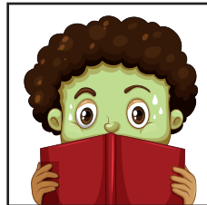
Mwen ka rete lakay si ..