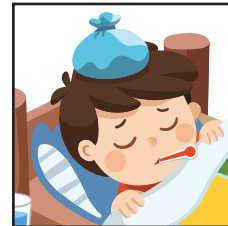
Rele doktè si...