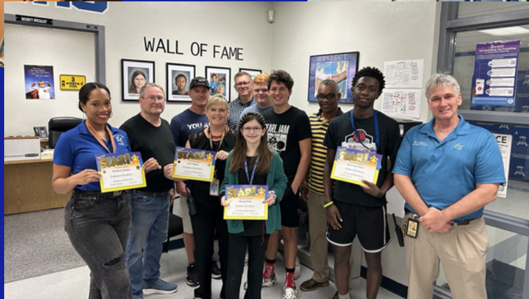
The November Hall of Fame Recipients