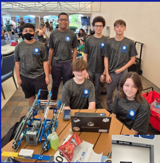
2nd Place finishing Robotics team! Way to go!